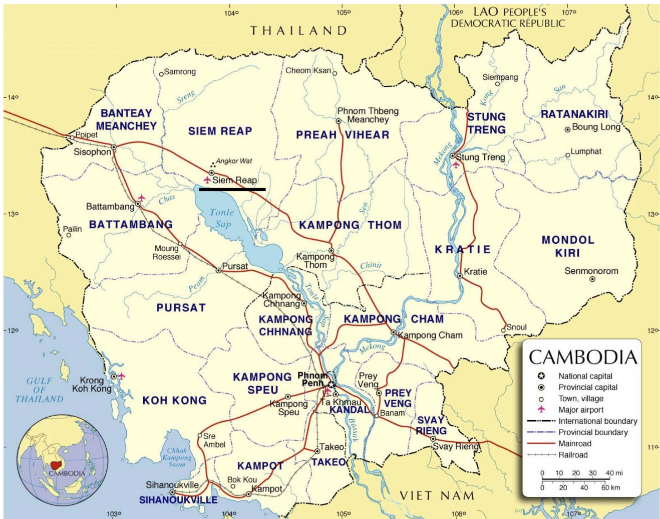
Figure 1. Location and map of Cambodia. AHC is in Siem Reap (underlined). Map: United Nations, 2004 ( http://www.un.org/Depts/Cartographic/map/profile/cambodia.pdf ). Accessed 2nd January 2013. doi:10.1371/journal.pone.0060634.g001

little published information on the causes of fever in Cambodian children.