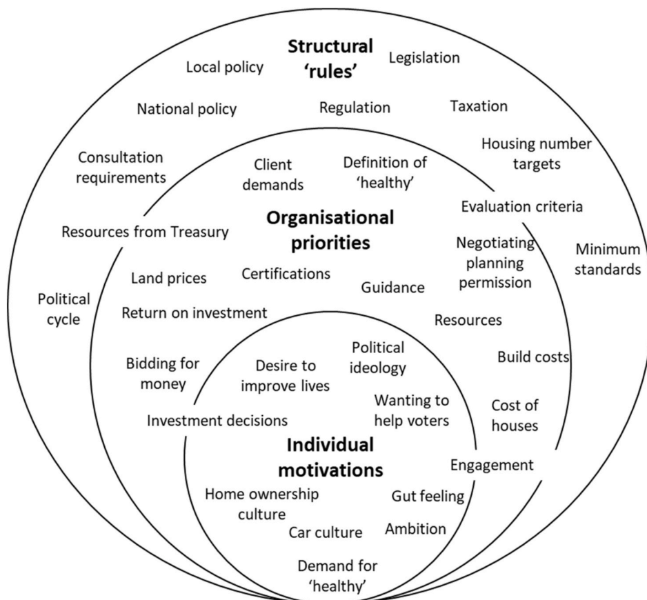
Fig. 3. Summary of issues at different levels that appear to affect urban development decision-making and population health outcomes.